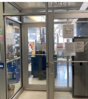
New confined lab