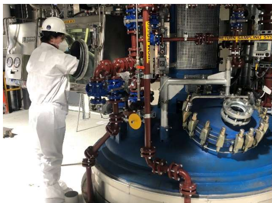
New Corticosteroids plant