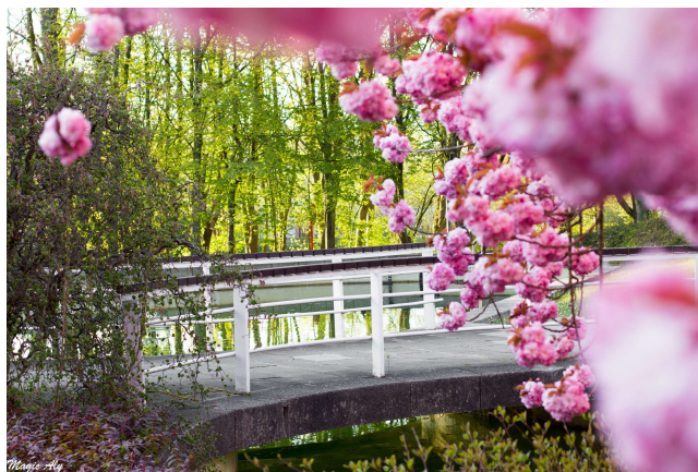
Belgium high potent site in spring