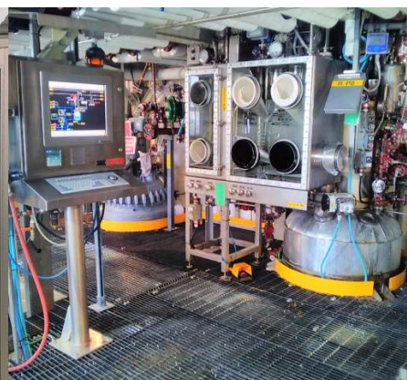
Pilot plant in Montreal