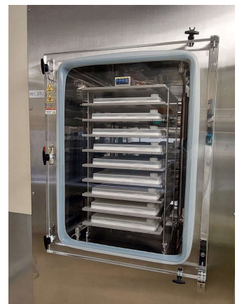
New freeze-dryer (2023)

Factories :Beuvry-la-forêt, Dunkerque, Louvain-la-neuve, Montreal api@minakem.com