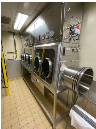
New Isolators (2023)